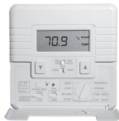
Above: An easy-to-use digital setback thermostat installed by HG&E.

For Residential HG&E Natural Gas Heating Customers only. Thermostat suitable for standard low voltage control systems only. Other non standard control systems may require an alternate thermostat model at a higher price. Offer expires 3/31/07.