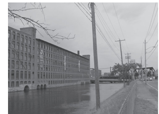
above: a Downtown area where duplicate electrical poles are slated for removal as part of this upgrade project

(closest to the River) north to Walnut Street. This area encompasses the Flats, South Holyoke, and the Historic Downtown Canal District.